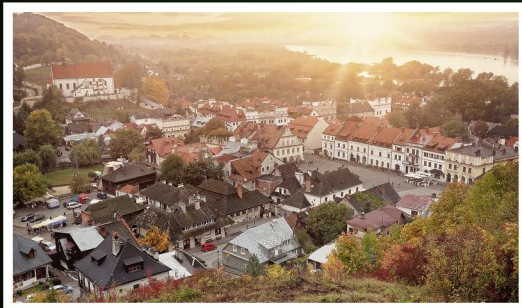
21 nd -23 th November 2019, Kazimierz Dolny, Poland

Registration and abstract submission: 10th May 2019